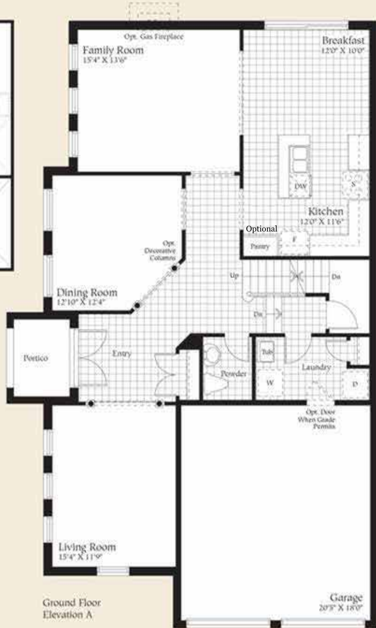
Ground Floor Elevation A