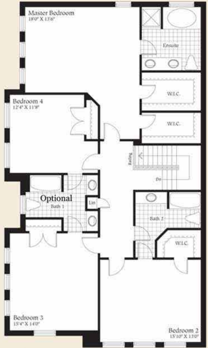
Second Floor Elevation A