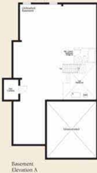
Basement Elevation A