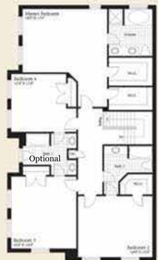
Basement - Elevation A