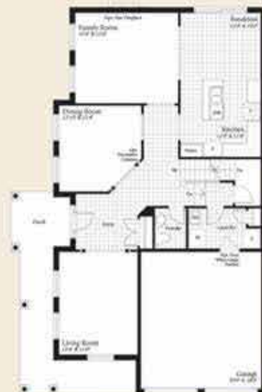
Second Floor - Elevation A